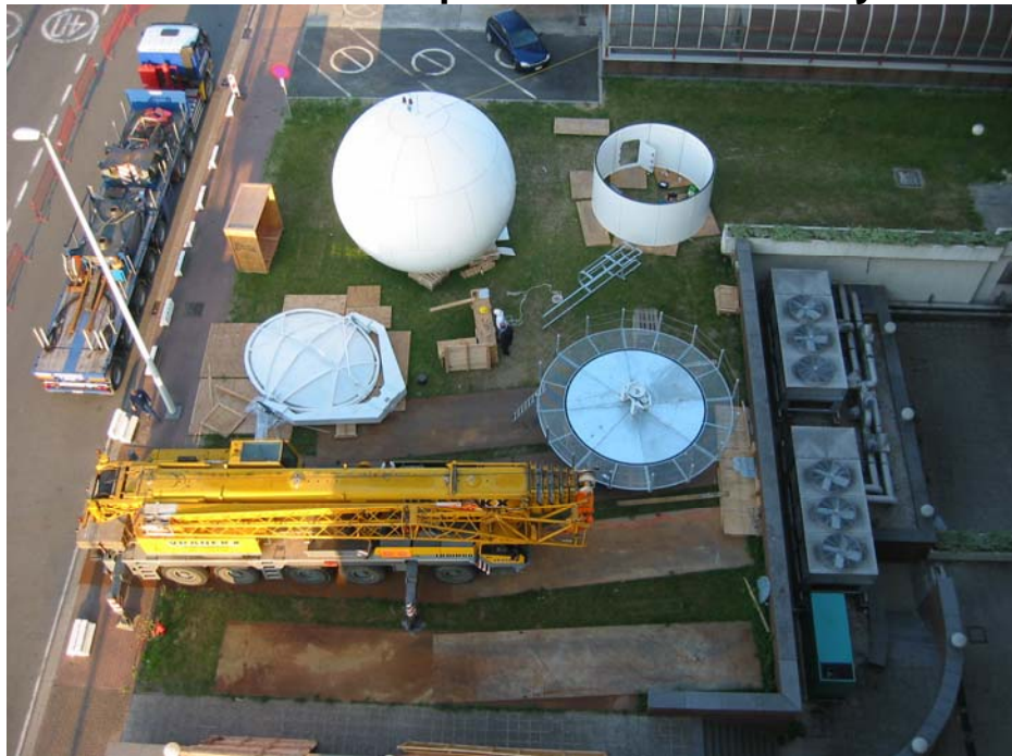
Radome, Antenna and support components prior to lifting into place.