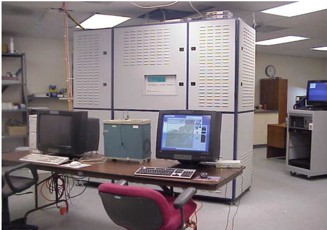
Belgocontrol TDR 43-250 During FAT Testing