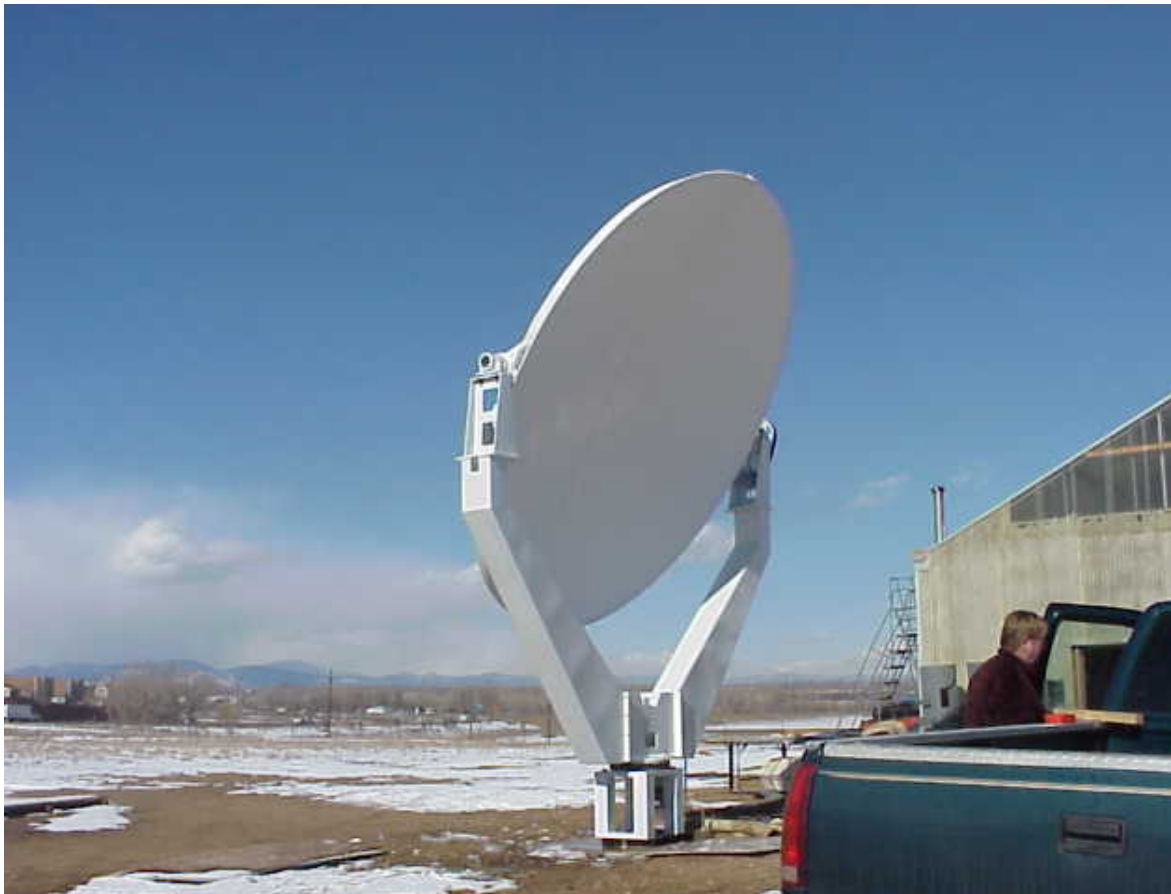
Belgocontrol Antenna & Pedestal Being Setup For Factory Testing

The following photographs illustrate the system installation.