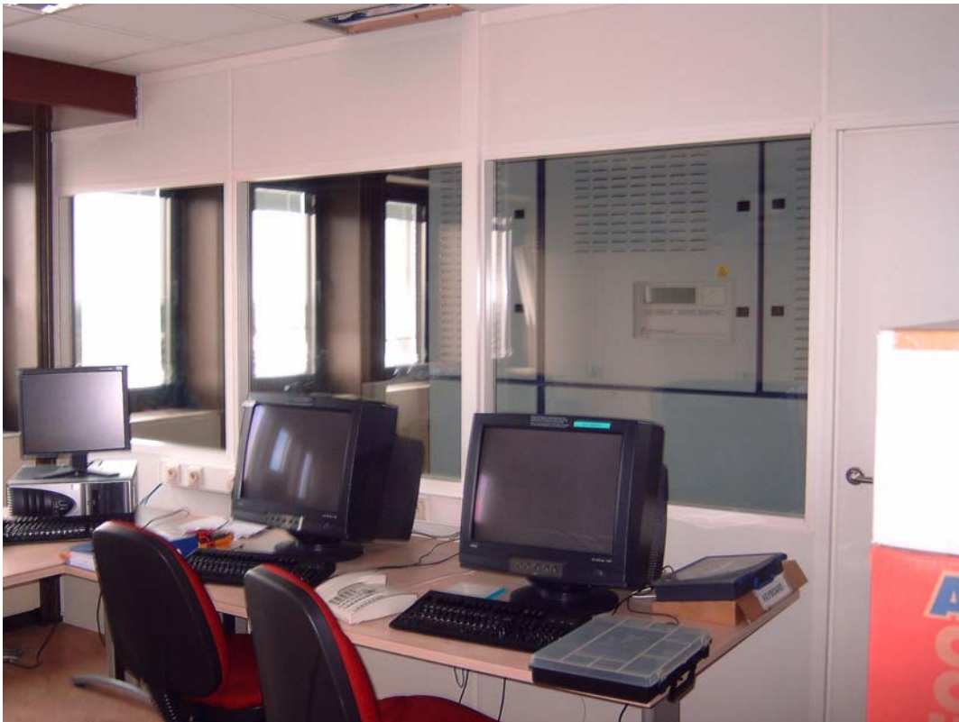
Belgocontrol TDR 43-250 Operations Area At Brussels International Airport

The diagram on the next page provides an overview of the radar data processing and distribution network. Radar data and analysis products are delivered to all users within the airport complex.