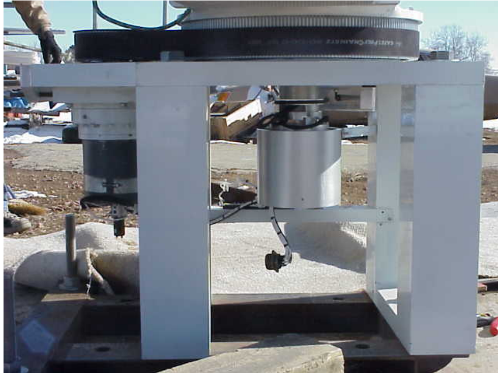
Closeup View Of Pedestal Mechanism