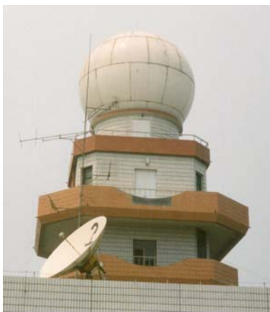
TDR Radar- Beijing Capital Airport

In addition, the TDR radars include a full range of capability to produce both PPI and volume scan data products for general meteorological usage. These products can be automatically generated and distributed to users.