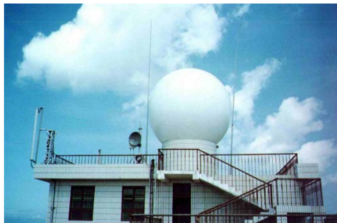
TDR Radar- Sanya Phoenix Airport