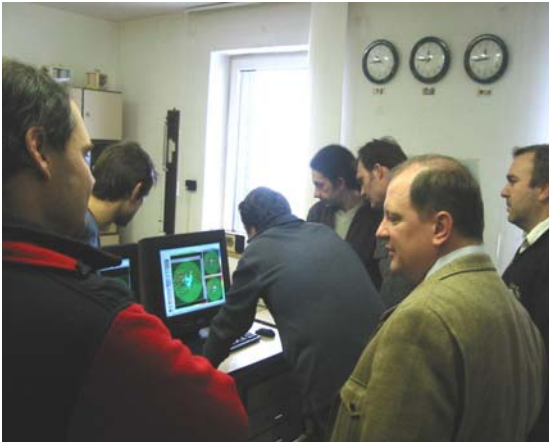
Above: Radar console displaying live image