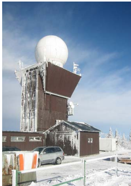
◀ SHMU weather radar site near Kosice, Slovakia